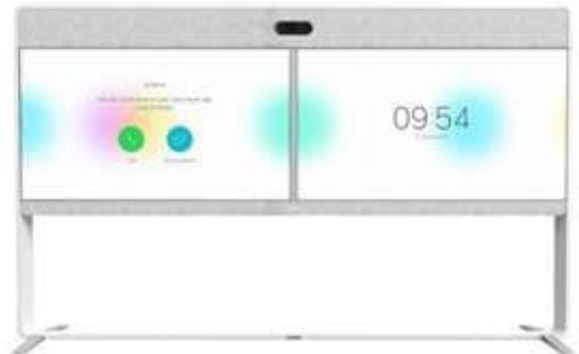
WEBEX ROOM 55