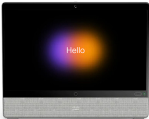
WEBEX DESK PRO

Cisco and Natilik have a collaboration device for every space. With billions of dollars being spent on research and development every year, you can be assured these devices really are best in class and your future investment in Cisco technology is well protected. Whether you are looking for personal devices, something to kit out your huddle spaces, or a fully integrated board room immersive solution, you can be assured that Cisco video devices will provide a secure, consistent, easy to use, high quality collaboration experience.